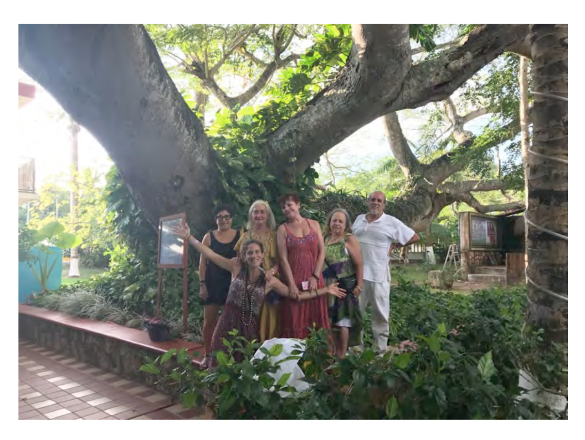
Natural Time Council Alfa 19, Overtone Moon of Radiance Kin 194 WHITE CRYSTAL WIZARD