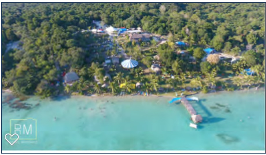
XV VISION COUNCIL, "THE CALL OF THE WATER". CAYUCO MAYA, BACALAR, QUINTANA ROO, MEXICO