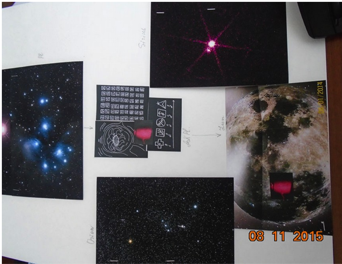
Map #1. Starry sky. Images of the Moon, The Orion Constellation, the Pleiads, Arcturus, Sirius