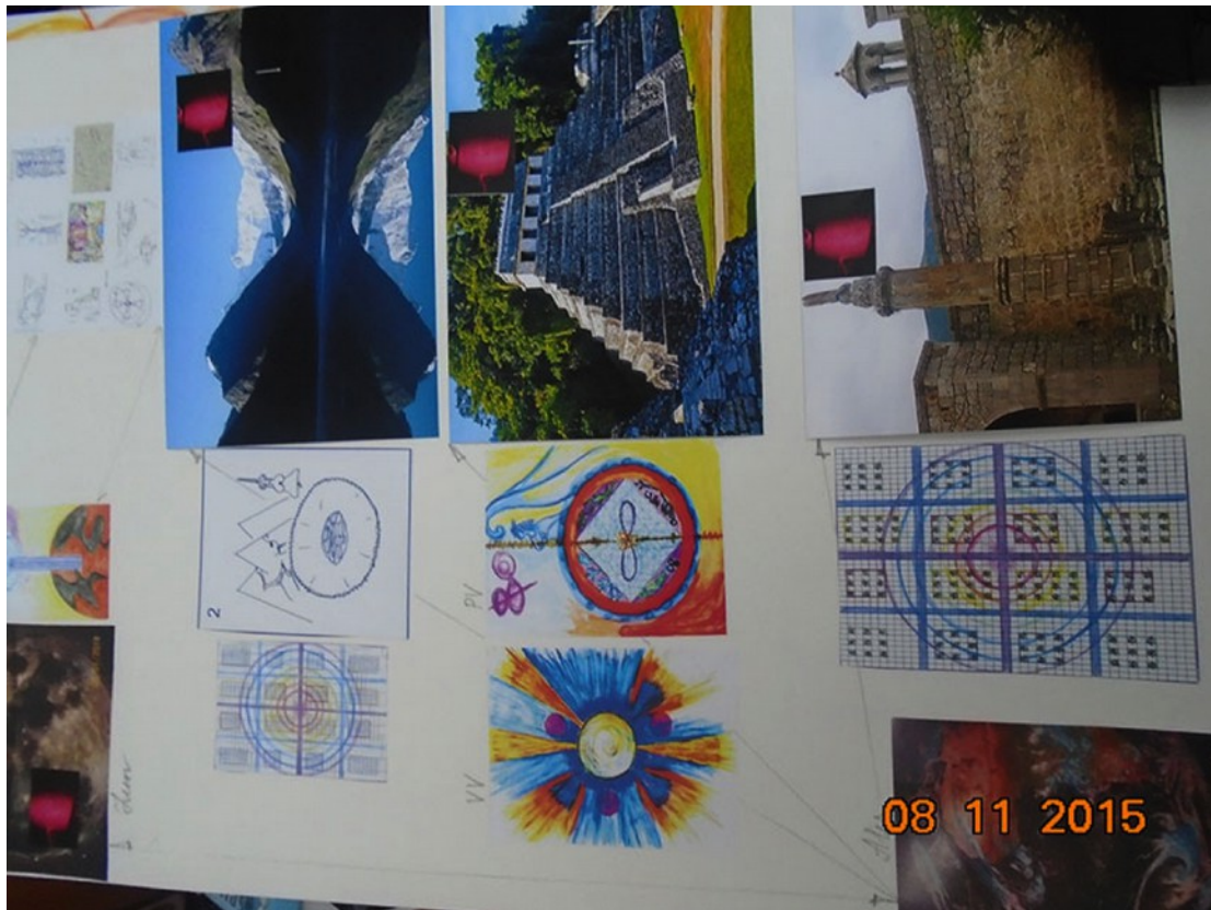
Map #3. Consciousness' trajectory of movement between the Earth and the Moon; real-life images of Tatevsky Monastery, in Sun, Armenia, Belukha Mountain in Altay, Russia, and Temple of the Inscriptions in Palenque, Mexico.

We have also established a vibrational frequency chart to be used as a means of data transfer during the transmission sessions in Kozyrev's Mirrors. The chart was developed from the Informational Modules Program. "Informational Modules" is a form of quantum teleportation technique that can be employed inside the operator's consciousness, created during experiments that were conducted in Kozyrev's Mirrors. It includes: