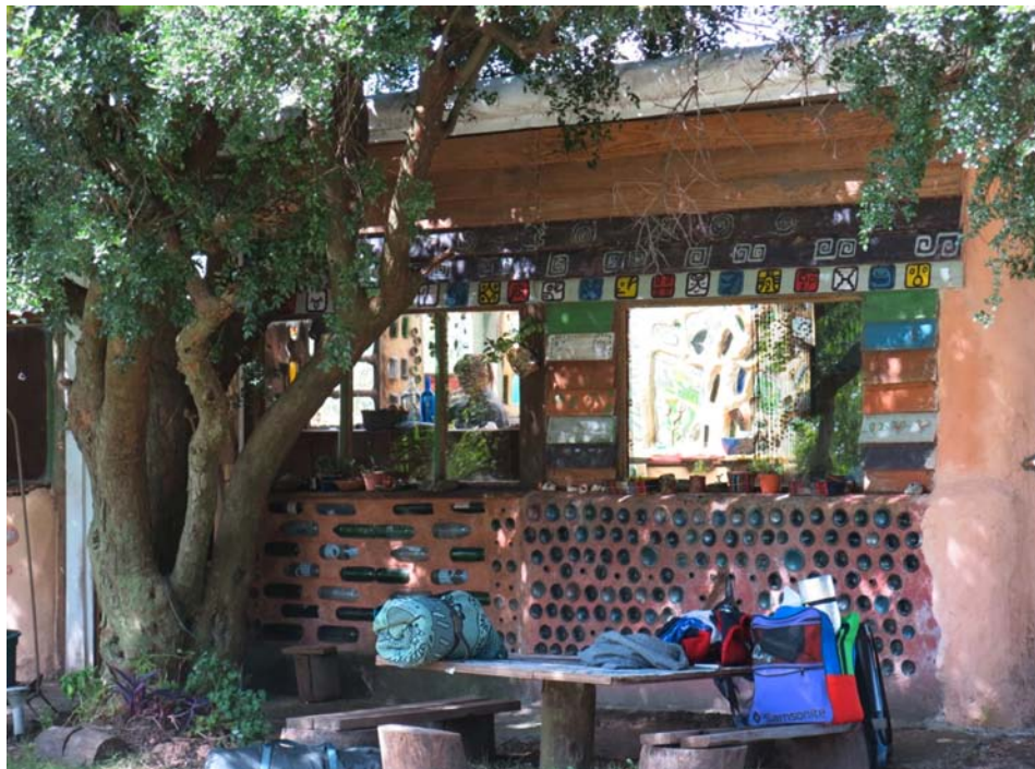
Meditation room ...