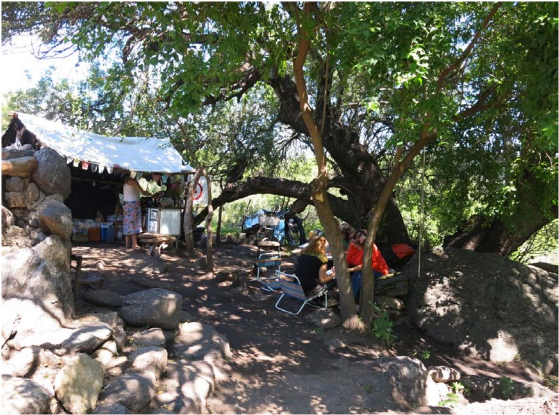
... An outdoor common kitchen area.

Here, kin are studying their daily practice and below is a ceremony being introduced by the Prayer to the Seven Galactic Directions and conducted by all the kin at Tribu Galaxica GM108X.