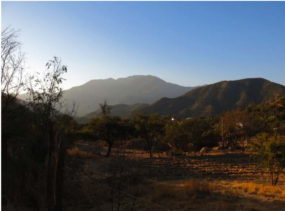
The beautiful valley that hosts the Peace Garden ...