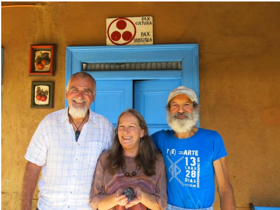
A beautiful moment ...