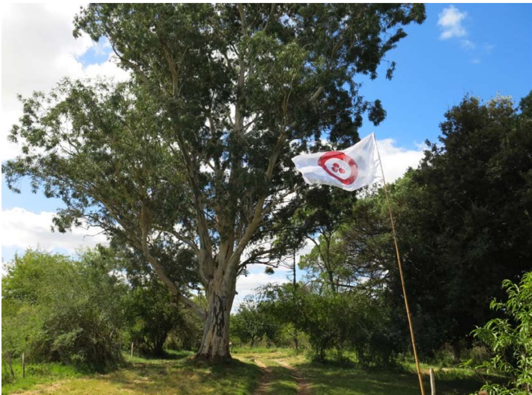
Entrance and Banner of Peace Flag.