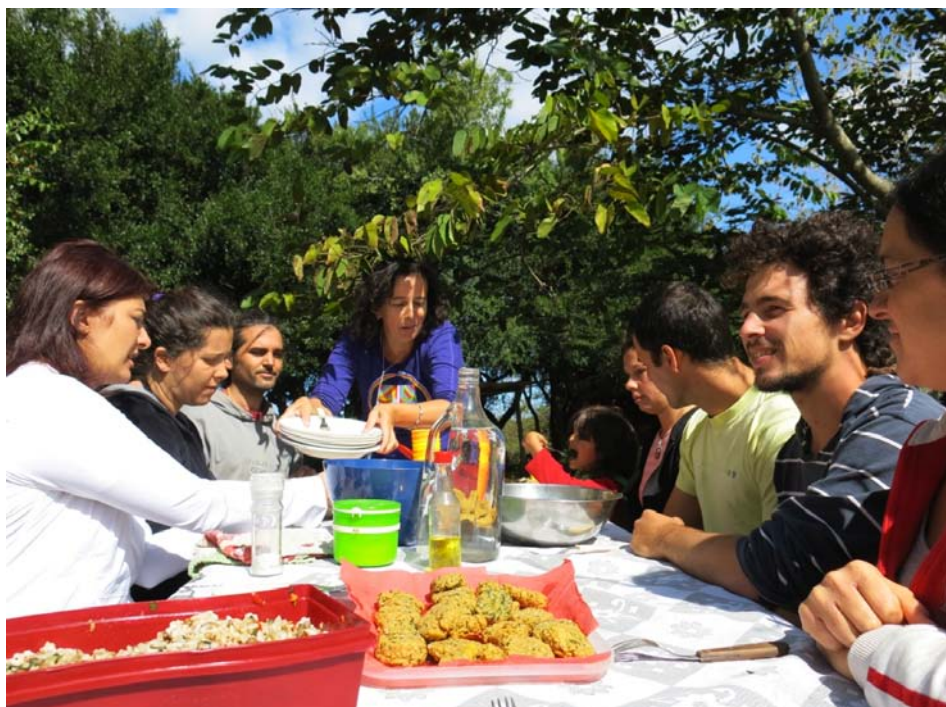
Lunch with kin ...