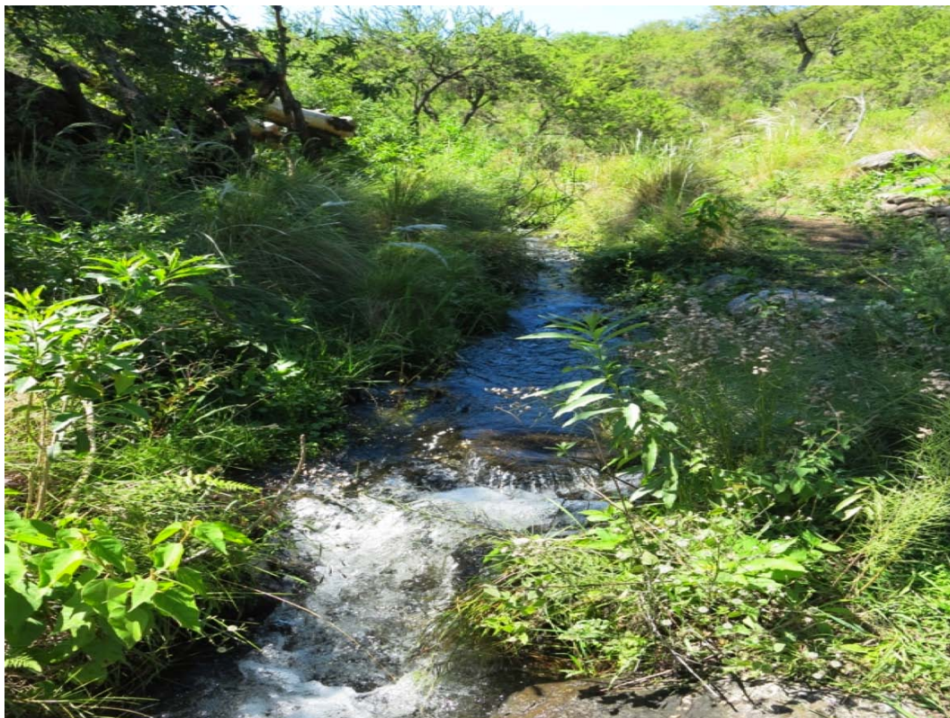
Pristine water supply runs through the property all year ...