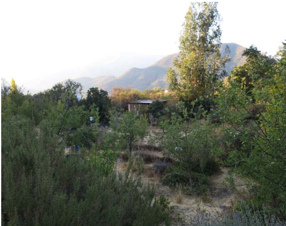
The property at Colliguay, Chile ... it is still in the grips of a 10 years drought ...