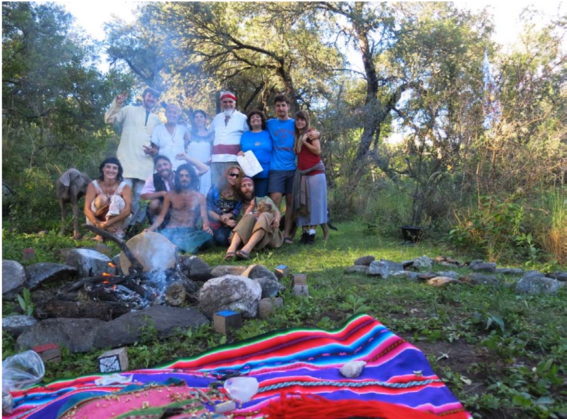
Kin gathering with all Argentina Peace Gardens represented.