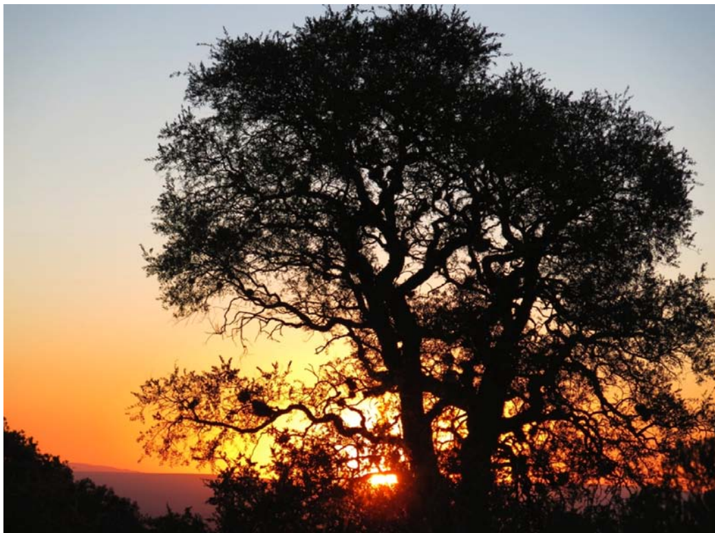
Beautiful sunset on the last day in Argentina before heading towards Chile ...