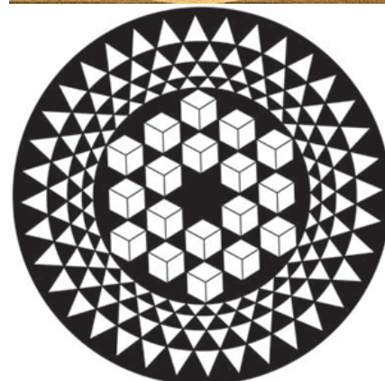
PRELIMINARY DIAGRAM by ANDREAS MÜLLER - NEW VERSION - www.kornkreise-forschung.de - www.cropcirclescience.org